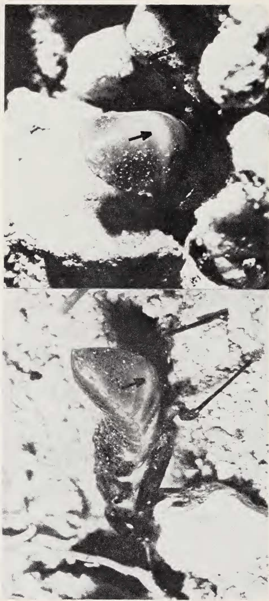
Figure 1. Hodoterpes mossambicus : dealate male in "calling" posture and at the same time excavating a hole. The zone of the sternal gland is widely protruded (light area marked with arrow).